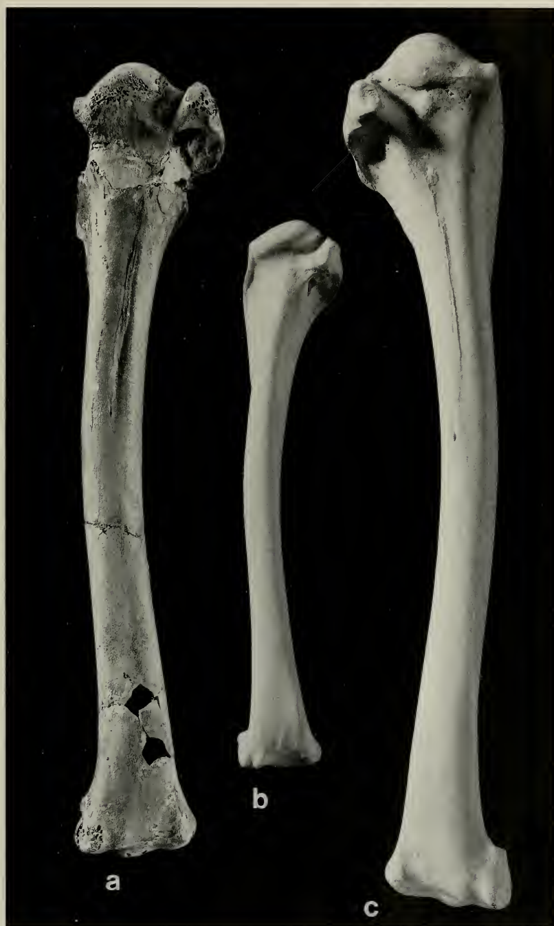
Fig. 2. Humeri in caudal view. a, Baelearica rummeli (Mlikovsky), left humerus, holotype, Michael Rummel collection, n° 3/21.0001. b, Tyto alba , recent, left humerus, Collection UCB, Lyon, n° 245-3. c, Baelearica pavonina , recent, right humerus, Collection UCB, Lyon, n° I-73. a and c, natural size, b 1.5 × natural size.